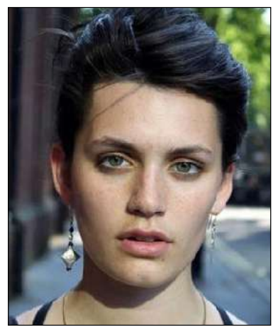
ELLA RUMPF CÉSAR AWARD WINNER 2024! La Théoreme de Marguerite. Won the European Shooting Star Award 2020 at the Berlin International Film Festival. Series-regular in TV series FREUD on Netflix, and in Tokyo Vice.

Check <u>www.gilesforeman.com</u> to see what's coming up at GFCA. Follow us on <u>Facebook, Instagram</u>, or our <u>Youtube</u> channel