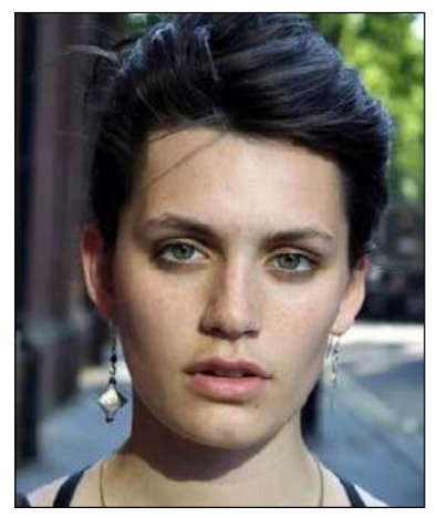
ELLA RUMPF CÉSAR AWARD WINNER 2024! La Théoreme de Marguerite. Won the European Shooting Star Award 2020 at the Berlin International Film Festival. Series-regular in TV series FREUD on Netflix, and in Tokyo Vice.

Check <u>www.gilesforeman.com</u> to see what's coming up at GFCA. Follow us on <u>Facebook</u>, <u>Instagram</u>, or our <u>Youtube</u> channel